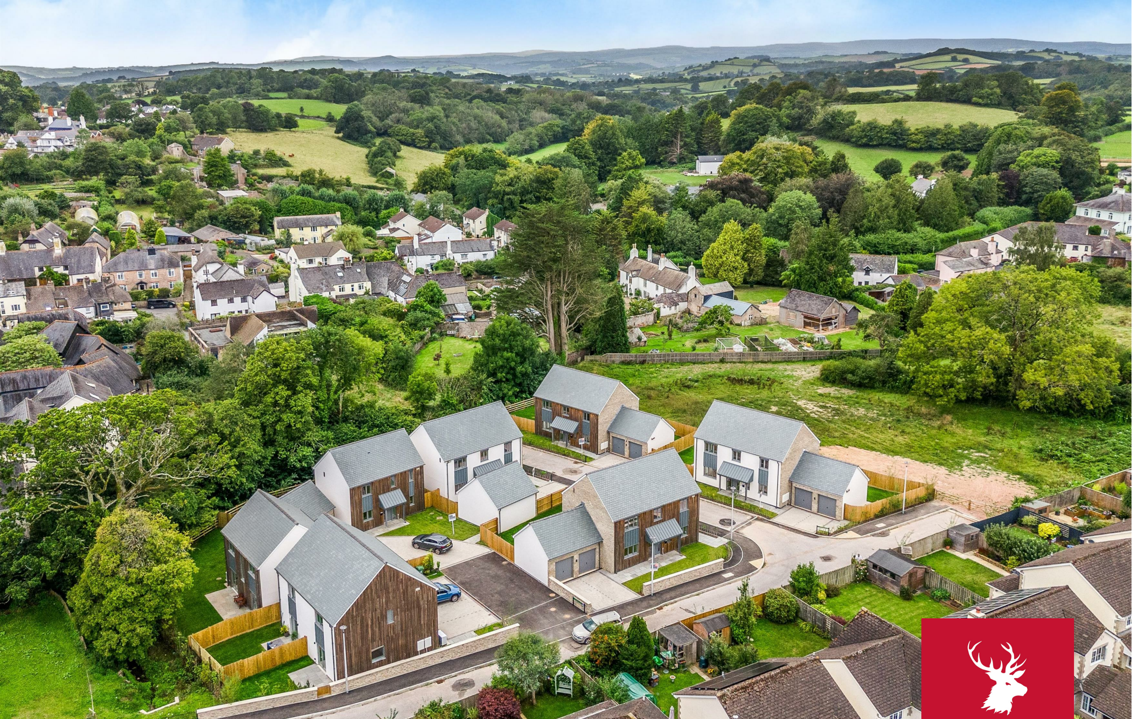
The Sweetbriar at Rosemoor